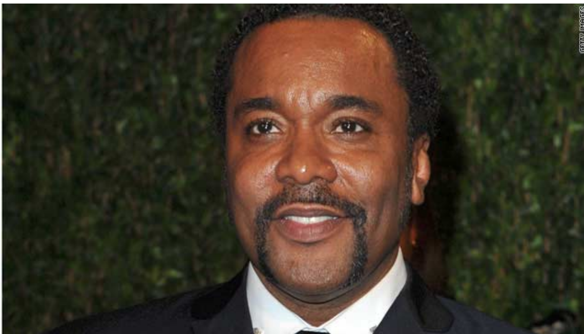
"Precious" director Lee Daniels received the career achievement award at the American Black Film Festival.